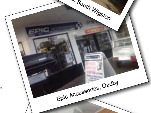
Epic Accessories, Oadby