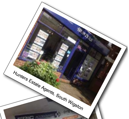
Hunters Estate Agents, South Wigston